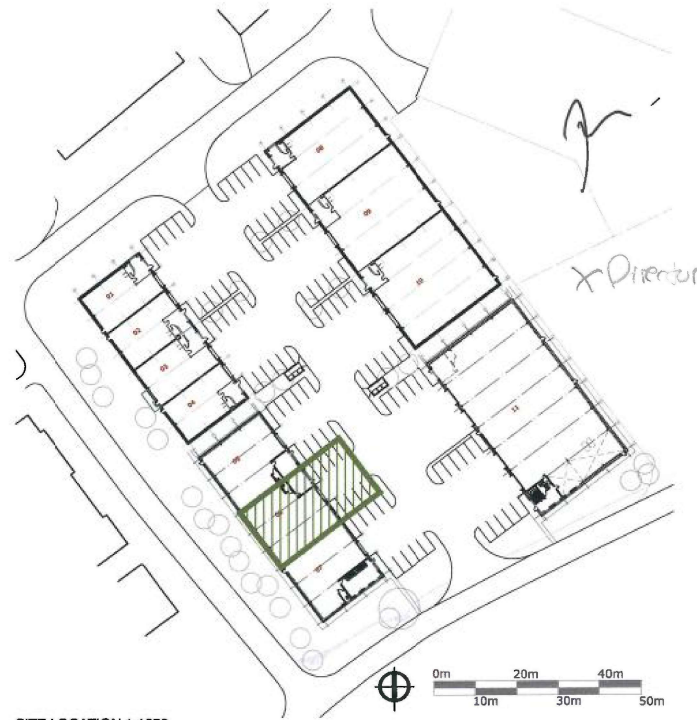
SITE LOCATION 1:1250